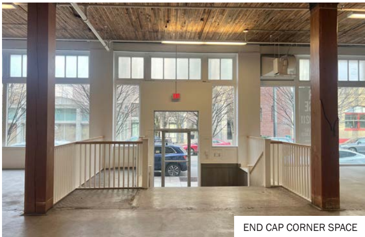
END CAP CORNER SPACE