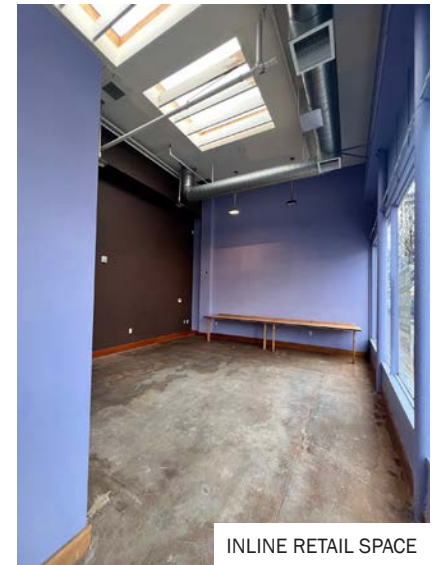
INLINE RETAIL SPACE