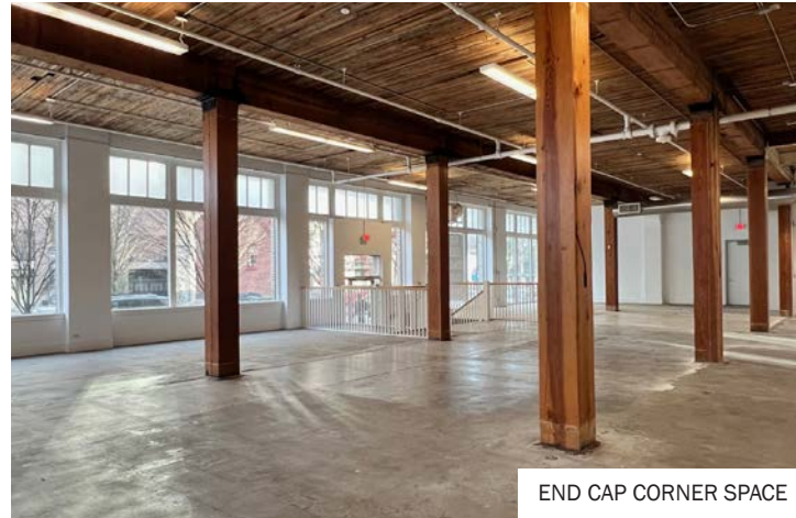
END CAP CORNER SPACE