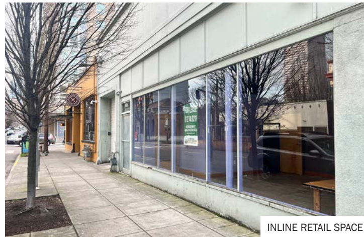
INLINE RETAIL SPACE